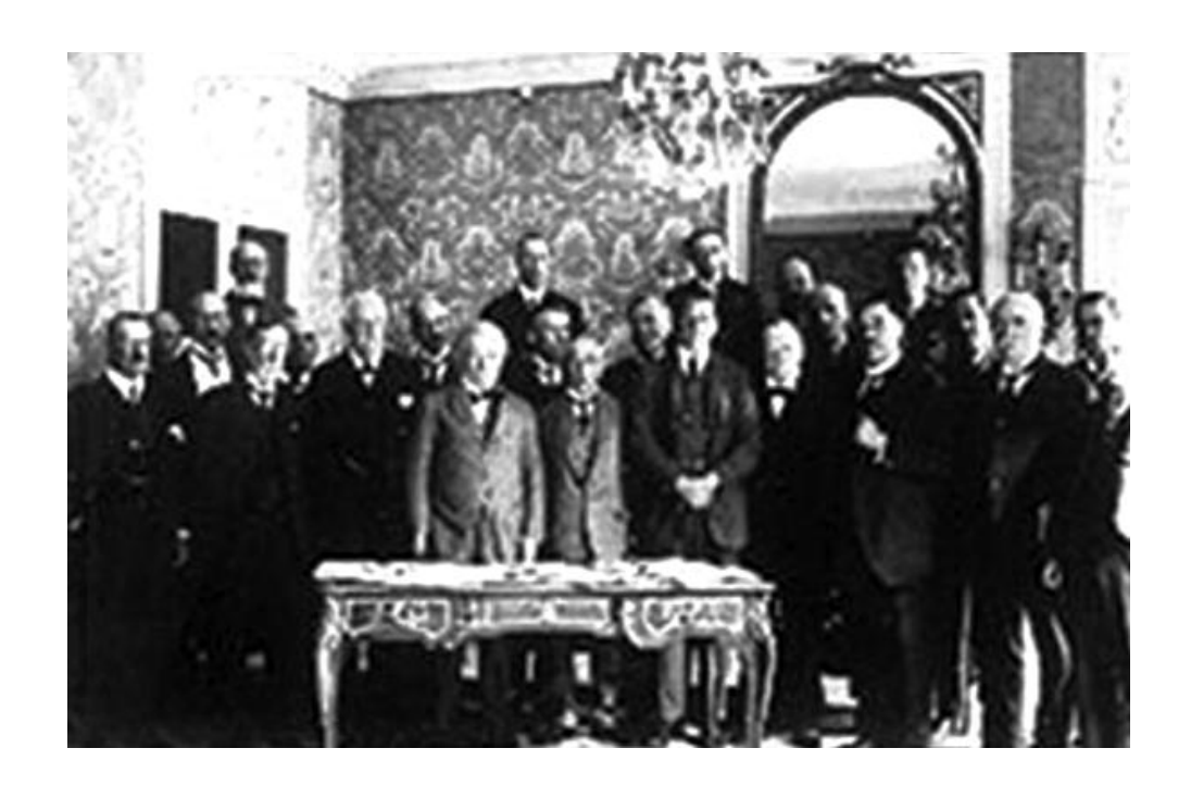
Participants of the Treaty of Sevres