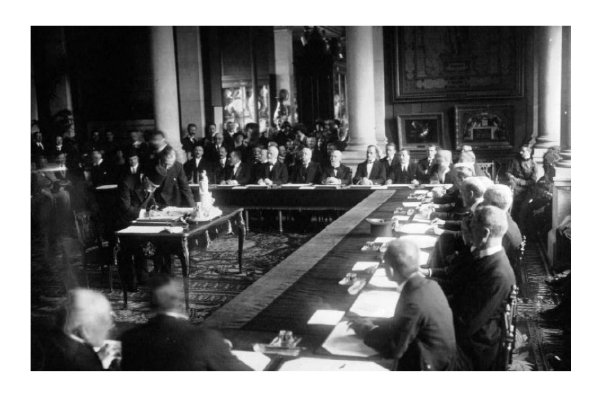
The Turkish delegation put his signature under the Treaty of Sevres