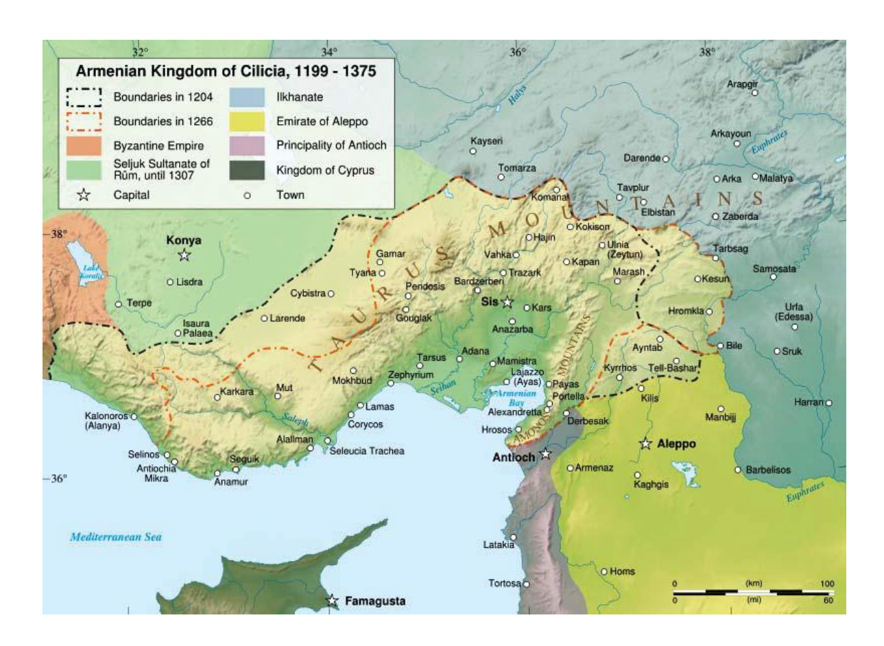
Map of Cilicia